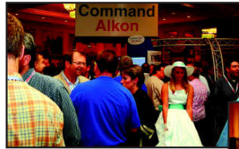
Scenes from the Command Alkon Customer Conference Tradeshow