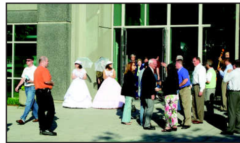
Customers arrive for the Open House at the offices of Command Alkon.

which is only a short drive from The Wynfrey. A warm, sunny evening, cold beverages and southern foods including some fried green tomatoes were specially ordered for this event. The reception was almost as fun for our employees as it was for our customers. Command Alkon employees could be found giving tours of their departments and offering up some good ole southern hospitality to their guests. We hope that all y'all that attended had a good time!