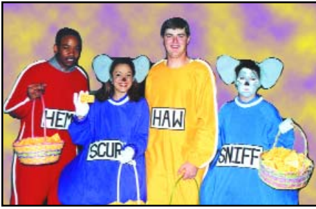
Characters from "Who Moved My Cheese?"

It's a warm, sunny Saturday morning in mid April and the guests have started to arrive for the Command Alkon Customer Conference 2001, one of the biggest events within the construction materials industry today. The setting is the polished Italian marble and French chandeliers of the Wynfrey Hotel in Birmingham, Alabama, which has played host to this event in the past. Boasting over 30,000 square feet of meeting space, over 300 guest rooms, an open connection to one of the Southeast's largest indoor malls, the Wynfrey is the perfect venue for this great event.