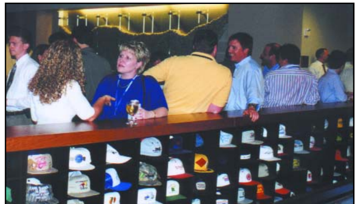
Everyone enjoys the new offices of Command Alkon