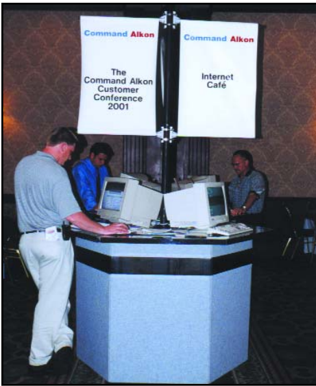
Checking e-mail at the Command Alkon Internet Café!